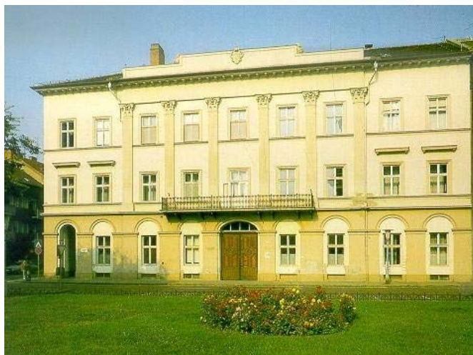
Hely ugyanott, ahol a konferencia: MTA Szegedi Akadémiai Bizottságának Székháza (SZAB) Somogyi u. 7., Szeged

4 June 2010 Friday Evening Wine & Cheese Reception